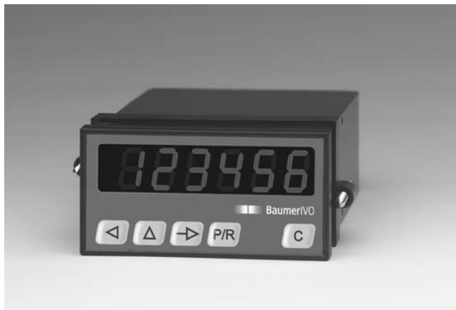
PCD41 - Process display