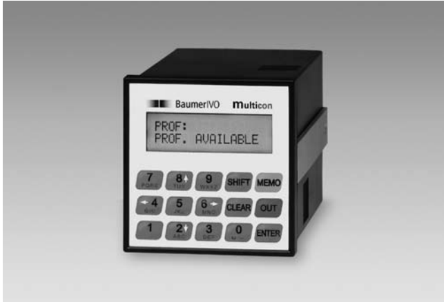
N 240 - Manual format alignment