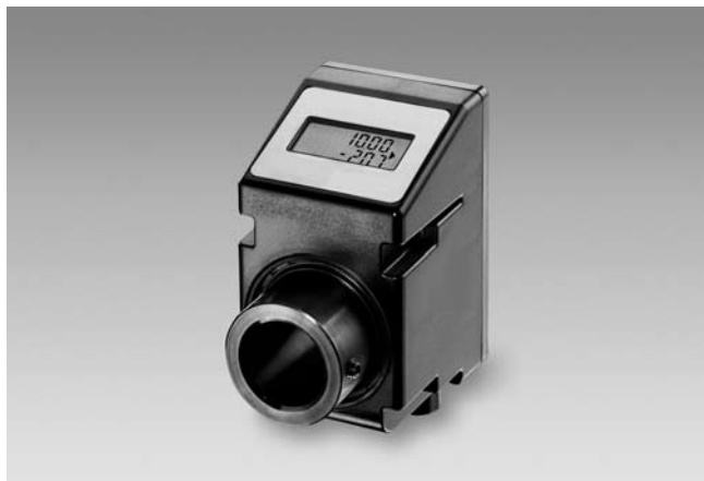
N 140 with cable output